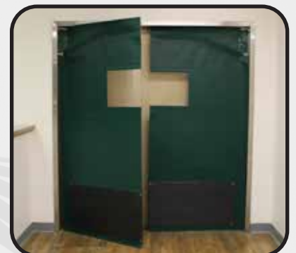
Shown w/ optional 18" impact plates