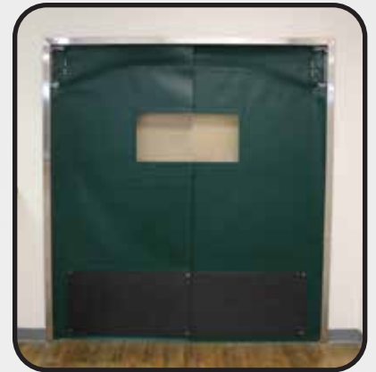
Shown in Forest Green