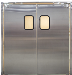
Stainless-Steel Hawk-SS model

Well known as The Door for restaurant, retail and other commercial applications, this solid core door model is available with High-Pressure Laminate, Stainless-Steel or Aluminum skins accentuating the environmental aesthetics while providing the durability required for those high-volume, hard-working environments.