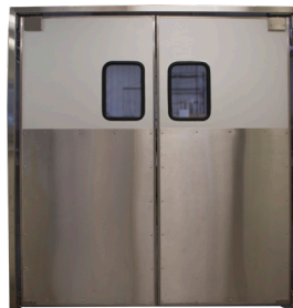
Aluminum Hawk-AC model (shown with 48" Stainless-Steel Kickplates)